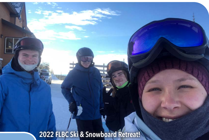
2022 FLBC Ski & Snowboard Retreat!