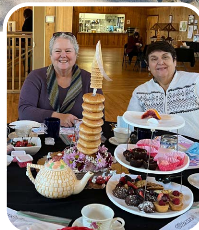
▲ Fun at FLBC's Tea Party, February 2022