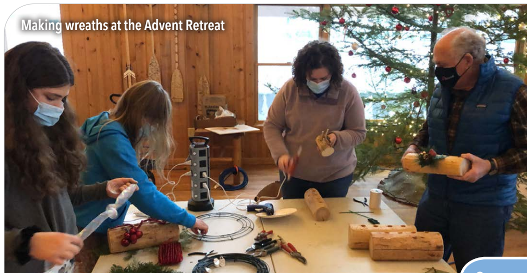
Making wreaths at the Advent Retreat