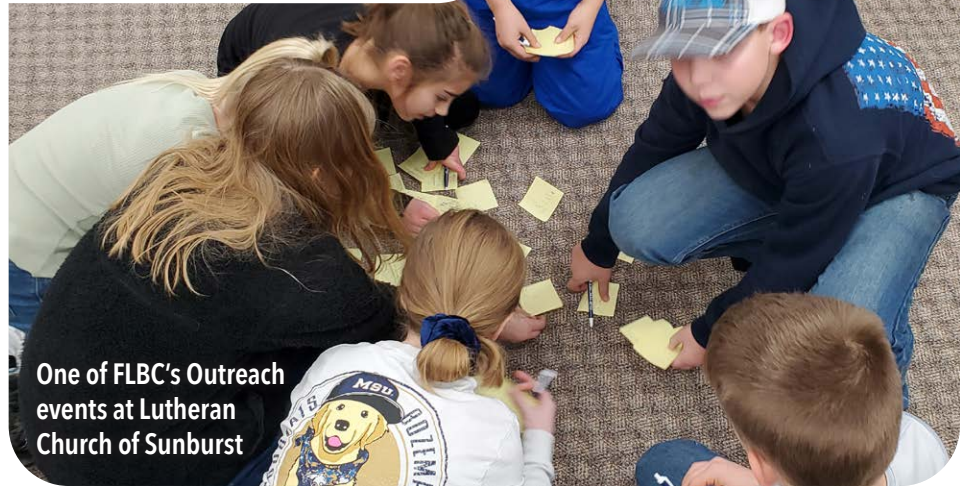
One of FLBC's Outreach events at Lutheran Church of Sunburst