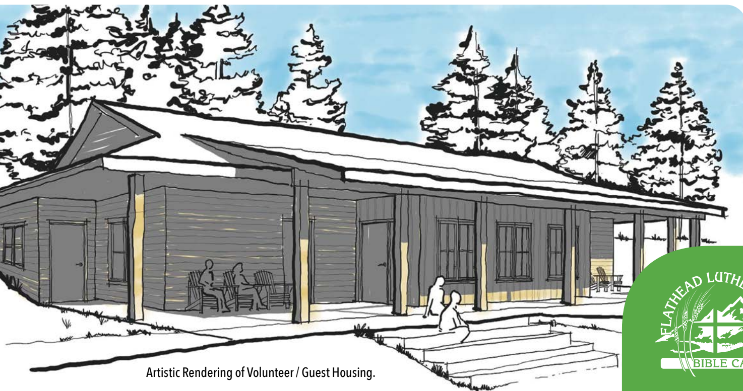
Artistic Rendering of Volunteer / Guest Housing.

Thank you for being part of a ministry where resurrection hope is lived and shared in every season.