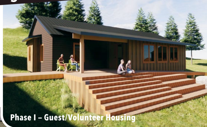
Phase I – Guest/Volunteer Housing

We pray you will find joy in joining in this exciting Hospitality Phase to make FLBC the best for all! Watch for more information. and/or contact FLBC.