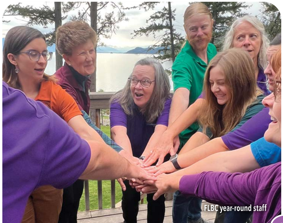
FLBC year-round staff